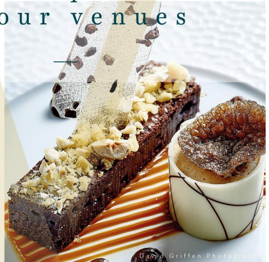
David Griffen Photography

WE LOVE TO TELL STORIES THROUGH OUR FOOD AND DRINK we use our creativity to link our food to the unique nature of our venues